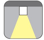
Surface Mounted Fixed