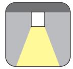
Surface Mounted Adjustable