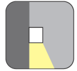
Wall Mounted Fixed