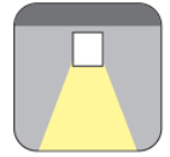
Surface Mounted Fixed